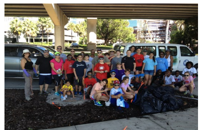
The STEP crew paddling around Lake Lucerne for clean up.